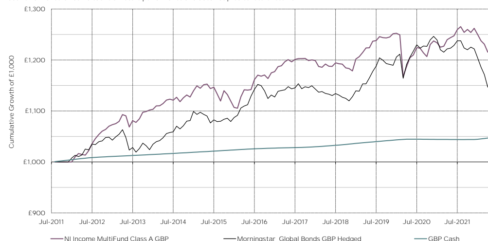
Class A GBP monthly returns and cumulative growth of £1,000

Past Performance is not indicative of future performance and does not predict future returns