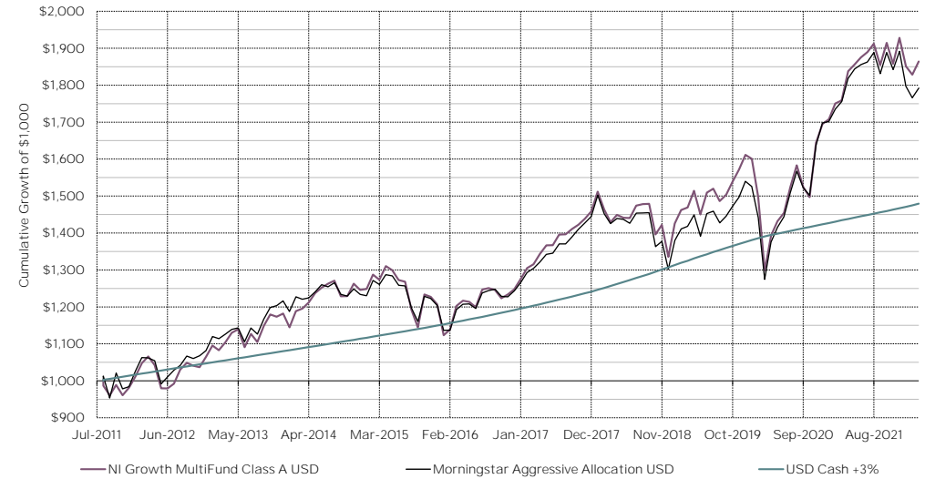
Class A USD monthly returns and cumulative growth of $1,000

Past Performance is not indicative of future performance and does not predict future returns